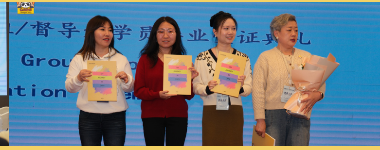
In-person Attendees of the 2023 Advanced Training Graduation