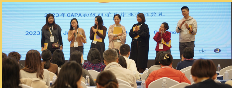
In-person Attendees of the 2023 Basic Training Graduation

Along with presentations and workshops, the annual CAPA graduation ceremonies were also held at the conference. Enjoy the <u>2023 Yearbook</u> of compiled thoughts, comments and messages from students, teachers and supervisors.